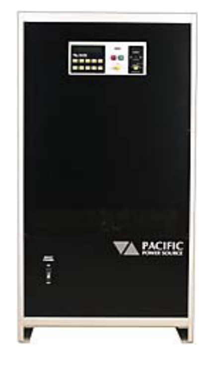
62.5kVA, 40-400Hz AC Power Source