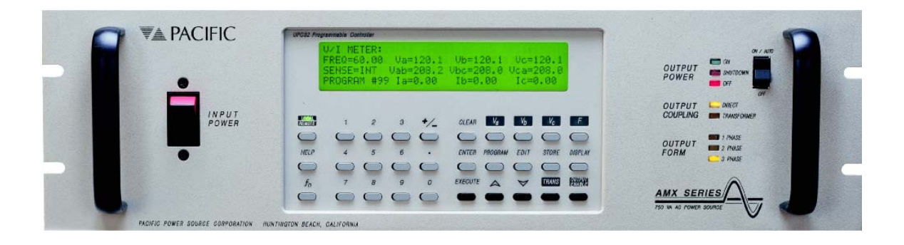
Figure 3. Remote Control for Electronic Power Supply

The only requirement for the solid state AC power source is a set of contactors so that the power supply output can be switched to power up the correct test equipment.