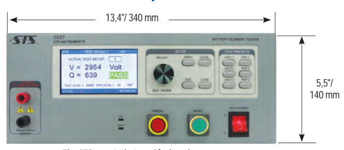
The STS 1657 is designed for bench top use.