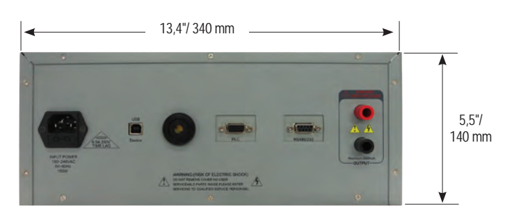
The STS 1657 Rear Panel provides connections for AC Input, USB interface, PLC I/O and RS232 interface option.