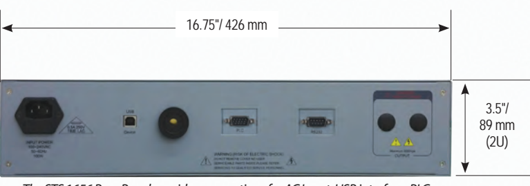
The STS 1656 Rear Panel provides connections for AC Input, USB interface, PLC I/O and RS232 interface option.